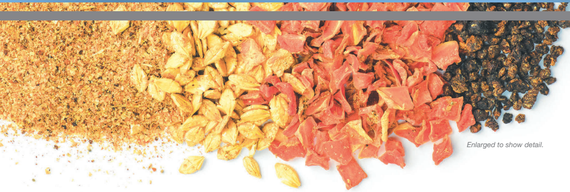
Enlarged to show detail.